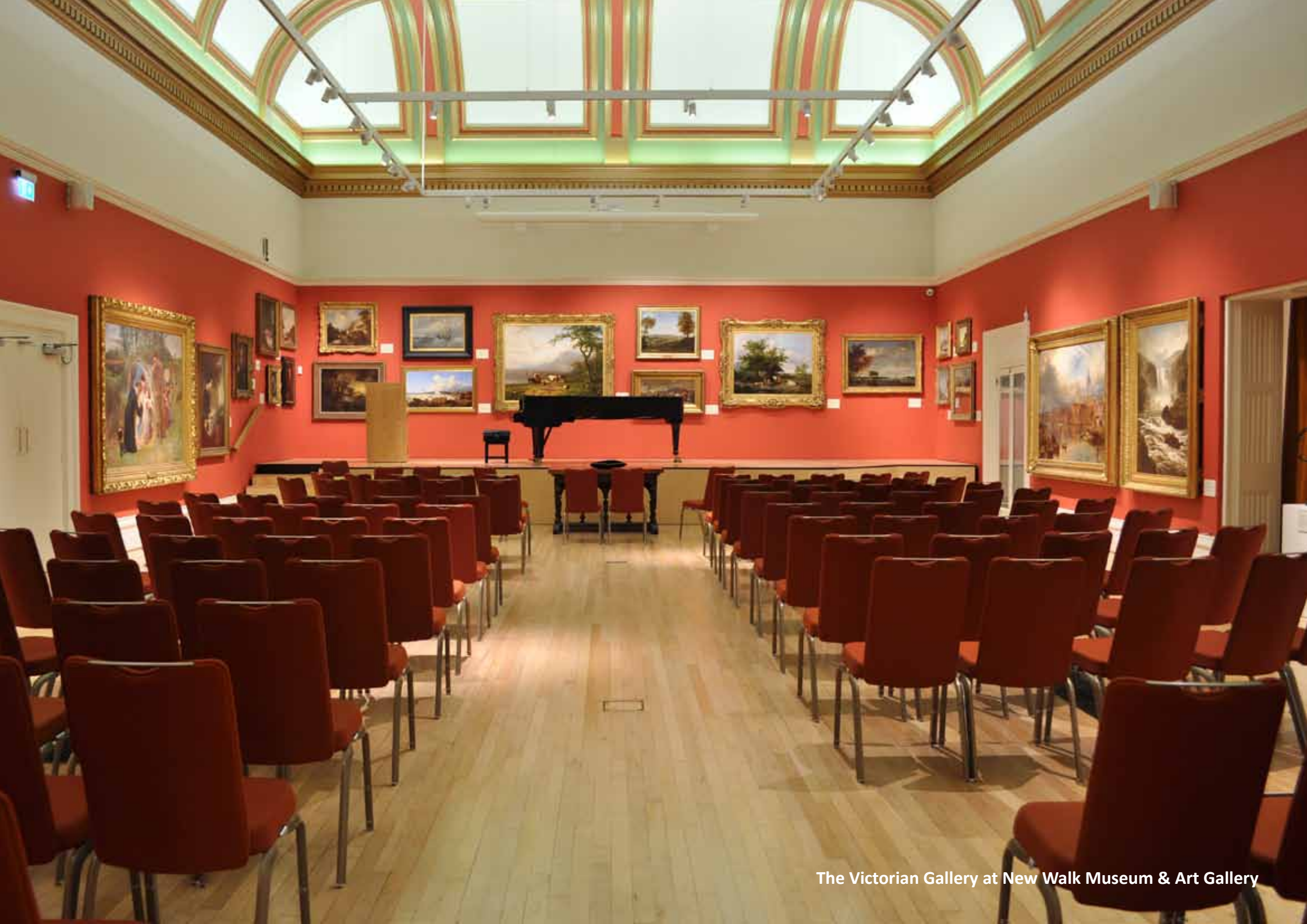
The Victorian Gallery at New Walk Museum & Art Gallery